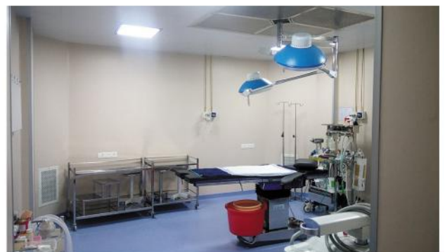
Vinyl Wall Covering