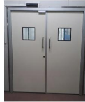
HPL Manual Swing Door