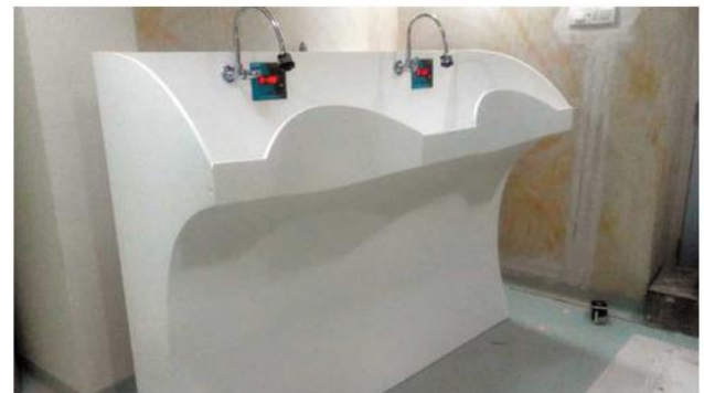
2-Bay Scrub Sink (Corian)