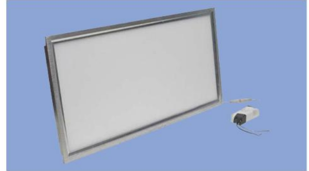
LED Peripheral Light