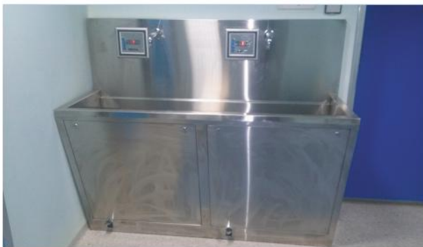
2-Bay Scrub Sink (SS-304)