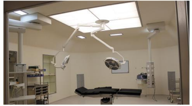
GI/PPGI Ceiling Panel