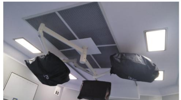
Calcium Silicate Ceiling Panel