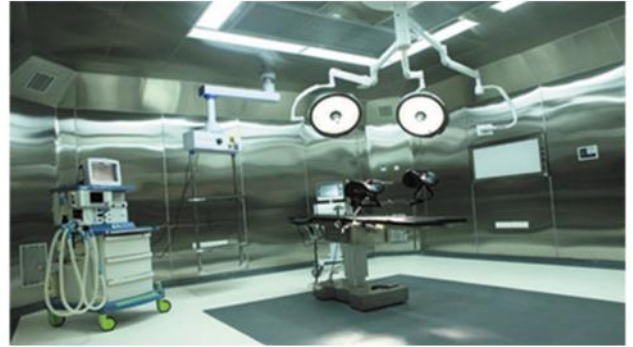
SS 304 Wall Panels