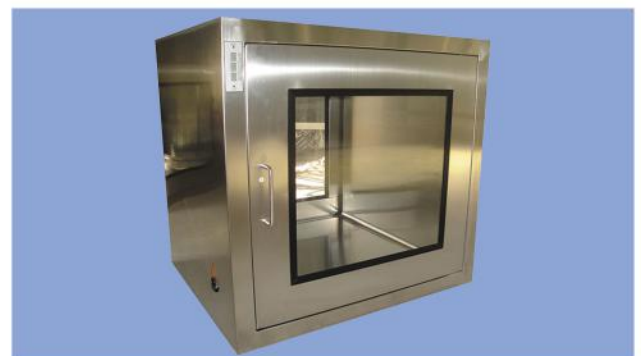
Hatch Or Pass Box