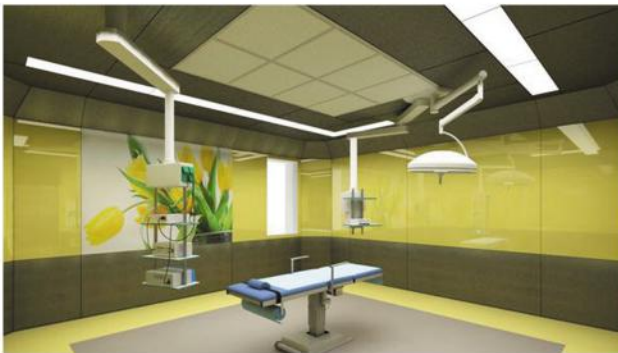
Graphic Glass Panel