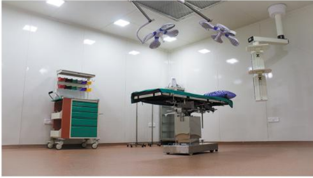
Corian Wall Panels

AMS walls can always be customized to meet every need & sets standards in terms of functionality and flexibility, aesthetics and quality.