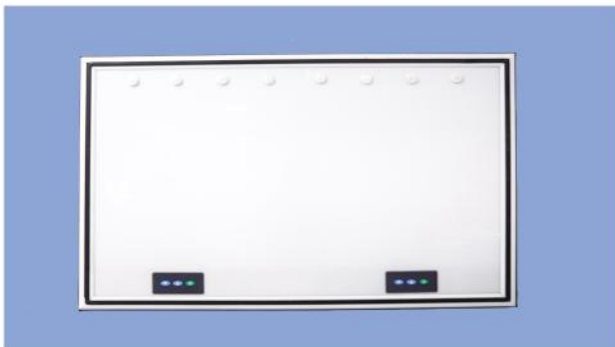
LED X-Ray Viewer