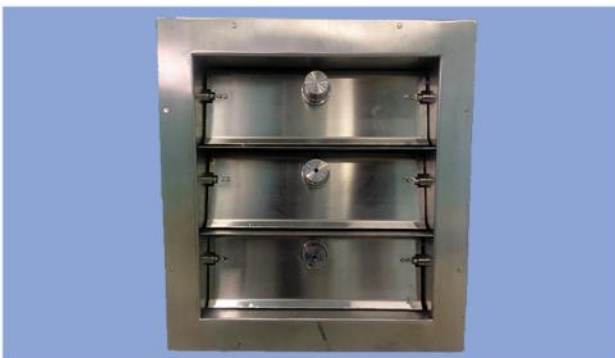
Pressure Relief Damper (PRD)