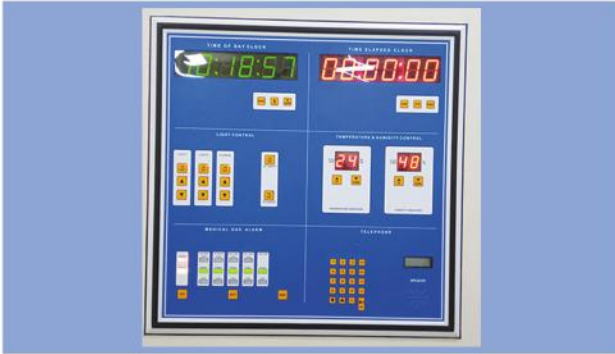
Surgical Control Panel

All Medi Solutions Solutions For All Hospitals