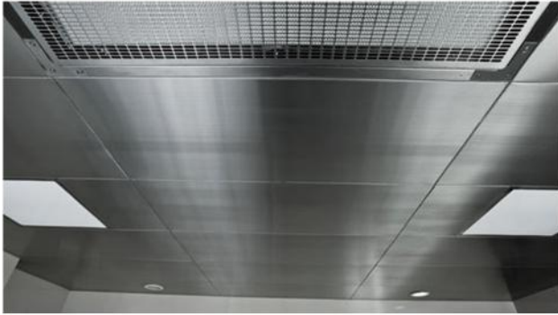
SS 304 Ceiling Panel

AMS Ceiling Panels can always be customized to meet every need & sets standards in terms of functionality and flexibility, aesthetics and quality.