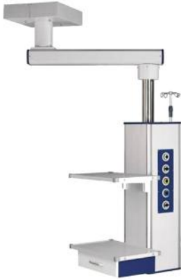
Single Arm Pendant (Anesthesia)