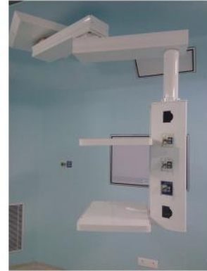
Double Arm Pendant (Surgeon)