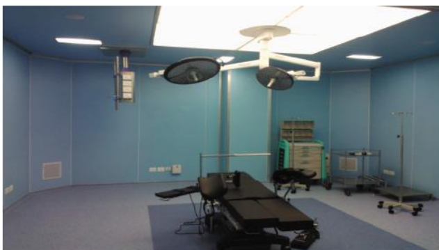
HPL Wall Cladding