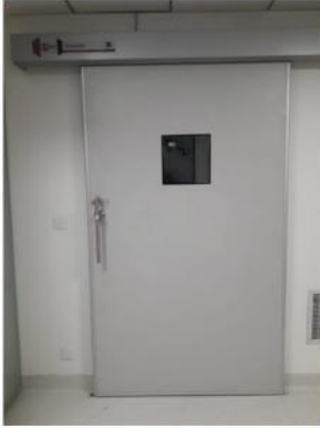
Hermetically Sealed Sliding Door